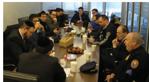
At a previous storm preparedness meeting